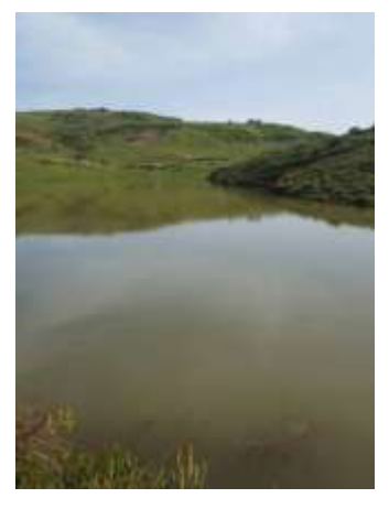
Figure 1: A general view of study area Al-Bireh Dam in 2/5/2023

Al-Bireh Dam is located Wadi El-Oyoun region - Hama Governorate - Syria at the eastern foot of Mount Nabi Matta at an altitude of 1100 meters above sea level. The length of the dam is 150 meters and its depth is 15 meters with a storage capacity of 100,000 cubic meters fed by mountain springs, river, streams, rain and snow. The region is characterized by waters temperatures range between -2° C in the winter and 27 °C in the summer (Fig. 1).